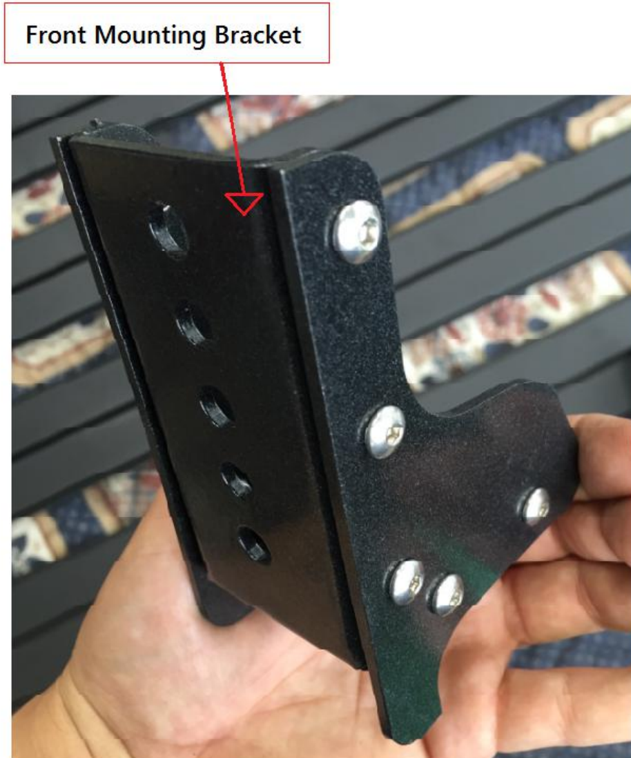
Figure 1: Rhino Rack Front Mount

In Figure 1 below is the assembled front mounting bracket consisting of one L bracket and two flat side plates. This bracket is riveted together with the ten 3mm rivets provided. (Figure 1)