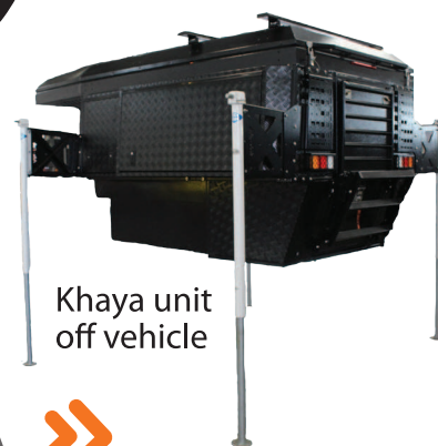
Khaya unit off vehicle