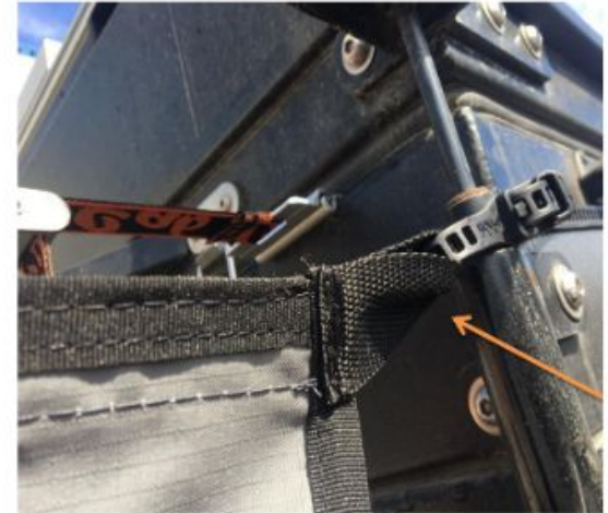
Various Fixture Points on the Vehicle