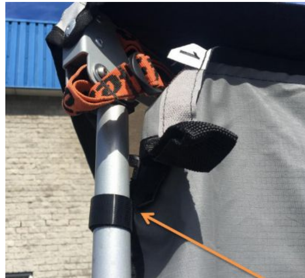
Tightened Velcro Straps on the Awning Sides Canvas