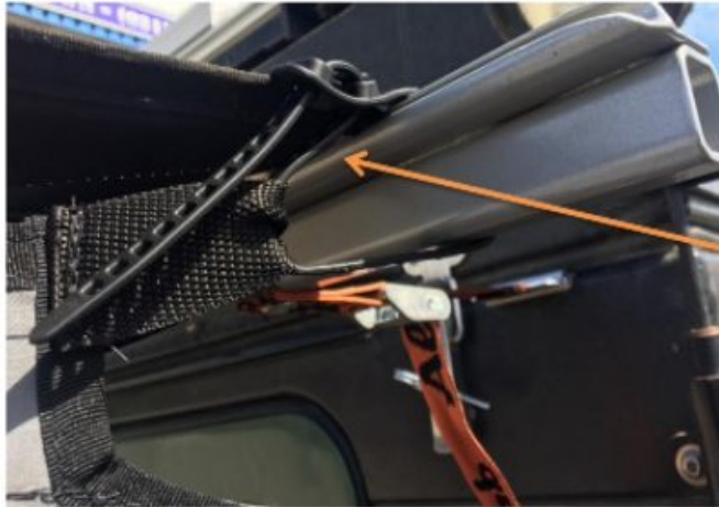
Flexi Ties and Canvas Loops

Flexi Tie Fastening of Sides: On the Side of the Awning Side, there are loops where we can thread through a Flexi Tie which we will use to attach the Canvas side to the vehicle. There are a few of these loops along the side of the Canvas so you just need to find any anchoring points you can on the vehicle.